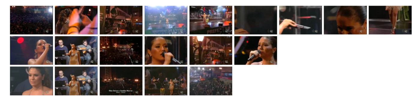
Figure 3: Summary produced by method of Gong et al. (2014) (top row), vs. STREAMING LOCAL SEARCH (middle row), and a user selected summary (bottom row), for YouTube video 105.

the elements corresponding to S_t are 1. MAP inference for the sequential DPP is as hard as for the standard DPP, but submodular optimization techniques can be used to find approximate solutions. In our experiments, we use a sequential DPP as the utility function in all the algorithms.