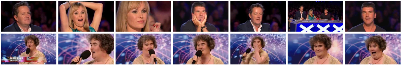
Figure 2: Summary produced by STREAMING LOCAL SEARCH, focused on judges and singer for YouTube video 106.