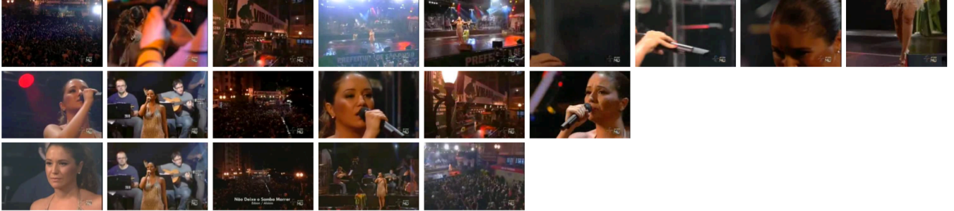
Figure 3: Summary produced by method of Gong et al. (2014) (top row), vs. STREAMING LOCAL SEARCH (middle row), and a user selected summary (bottom row), for YouTube video 105.

the elements corresponding to S_t are 1. MAP inference for the sequential DPP is as hard as for the standard DPP, but submodular optimization techniques can be used to find approximate solutions. In our experiments, we use a sequential DPP as the utility function in all the algorithms.